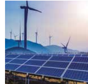
Renewable Energy Sources