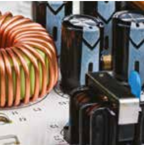
Switch Mode Power Supplies