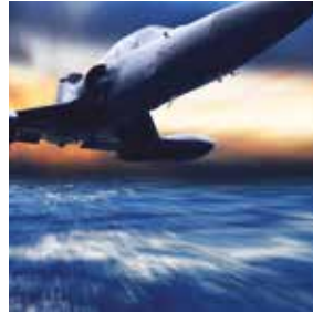
Aerospace & Military