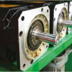
AC-DC Resonant Designs 1KW - 250KW