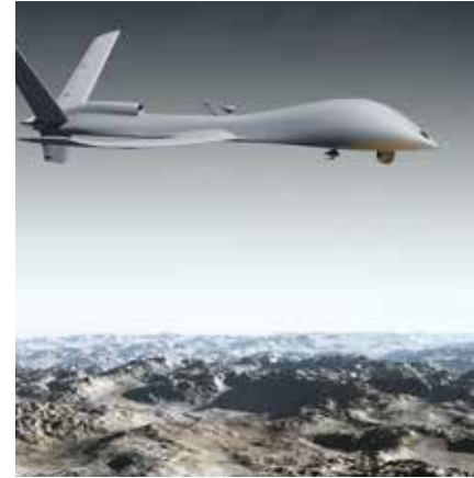
UAV (Unmanned aerial vehicle) electrical power and control

Our manufacturing capabilities suit military and aerospace customers very well. For instance, we offer automatic CNC, toroidal hook, and shuttle winding using 52 gauge to 5 gauge magnetic wire. Additionally, we can wind bobbins, layers, or self-supporting windings of foil, flat, or square wire. Likewise, our robust mechanical designs include impregnation, casting, molding, encapsulation, and vacuum potting for high voltage and other unique applications. Lastly, our magnetics solutions are fully optimized using in-house MIL-STD testing according to AS9100.