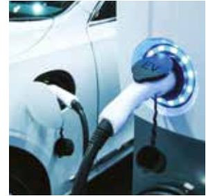
Automotive, Electric and Hybrid Vehicles