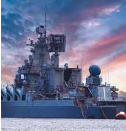
Naval ship board power supplies