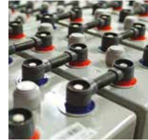
Battery Charging and Management Systems