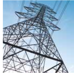
Distributed Isolated Power

Developing the right magnetics design requires optimizing weight, size, and materials for each specific application.