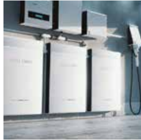
Grid Energy Storage 10KW-250KW