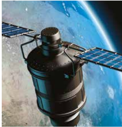
Satellite & space applications