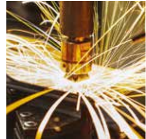
Welding and Lasers 1KW-250KW